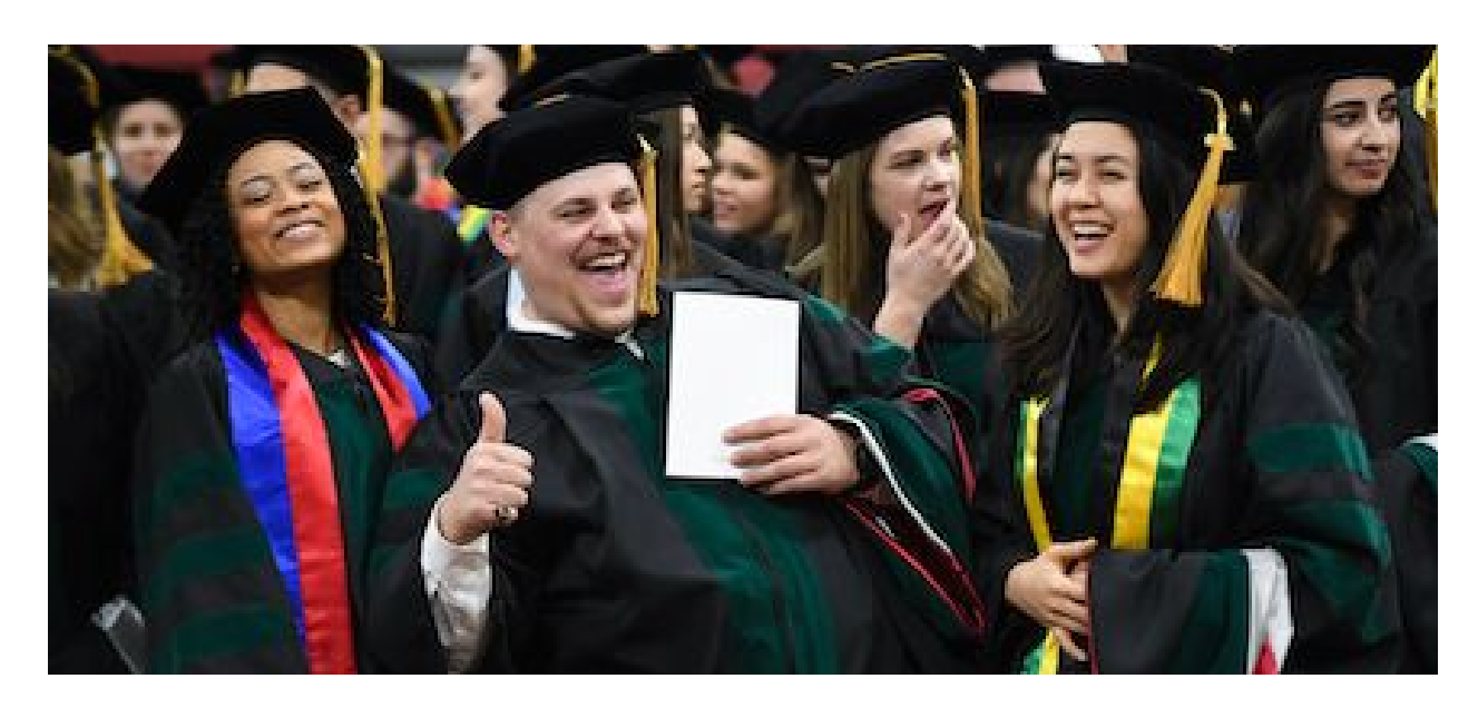
DPT Commencement Ceremony January 20, 2019